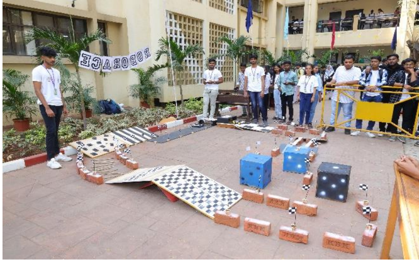
Students presented projects in Robotics